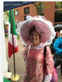
Dedicated booth sitters