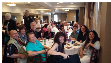
The delegates and guests at dinner