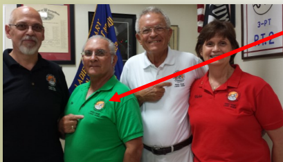
All colors of the Italian flag!